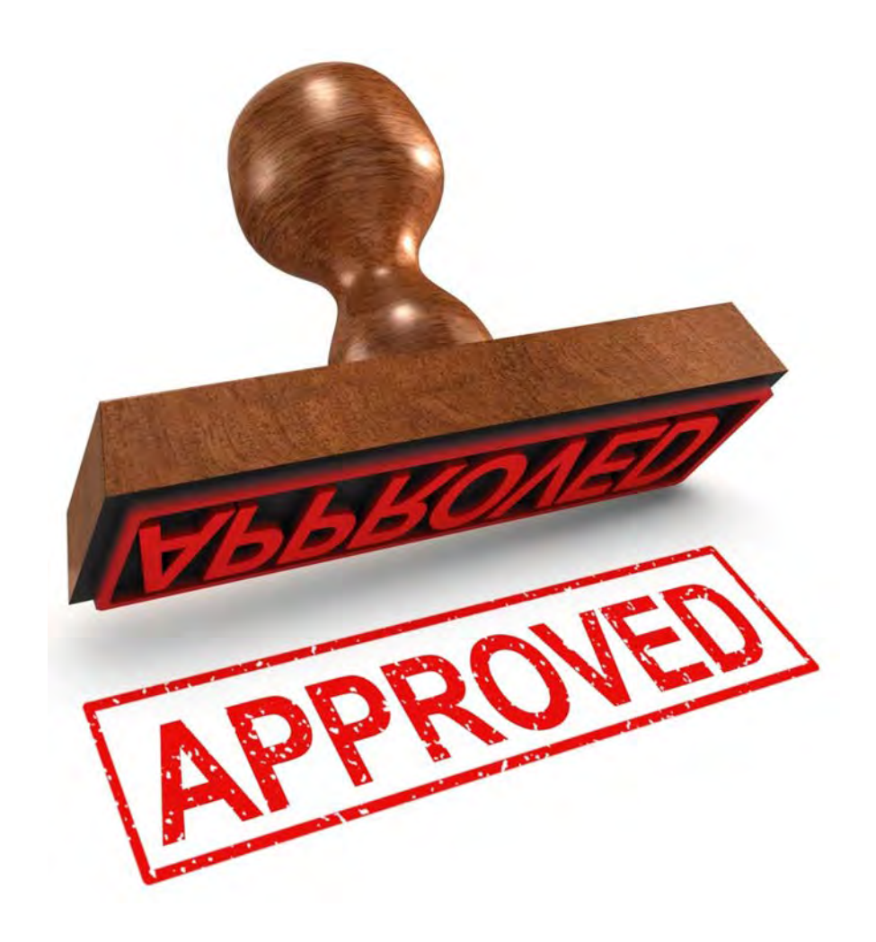
Section 2 - Refereral and Authorization Requirements